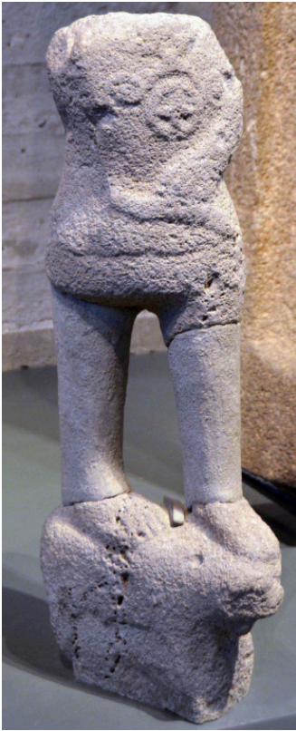
Statue of Baal standing on a bull (15th-10th century BC)