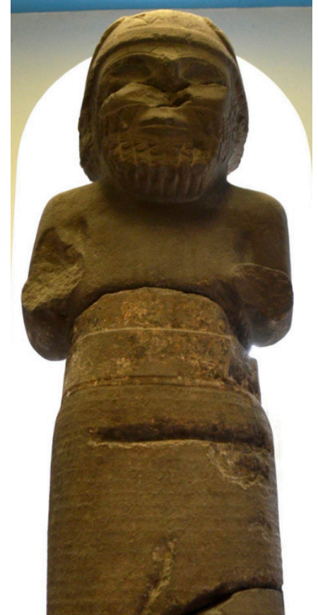
Colossal statue of the storm god Hadad/Baal