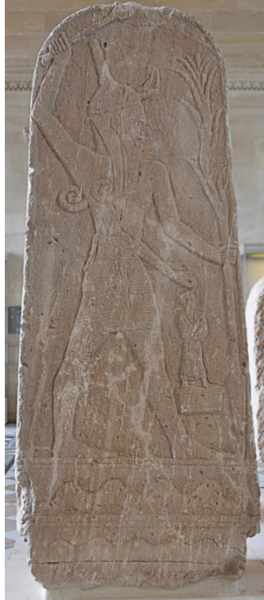
Baal with club and lightning spear (15th-13th century BC)