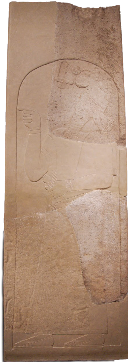
The Iran Stele of Tiglath-Pileser III, discovered in the Zargos Mountains of Iran, names “Menahem of Samaria” as a ruler who paid him tribute.